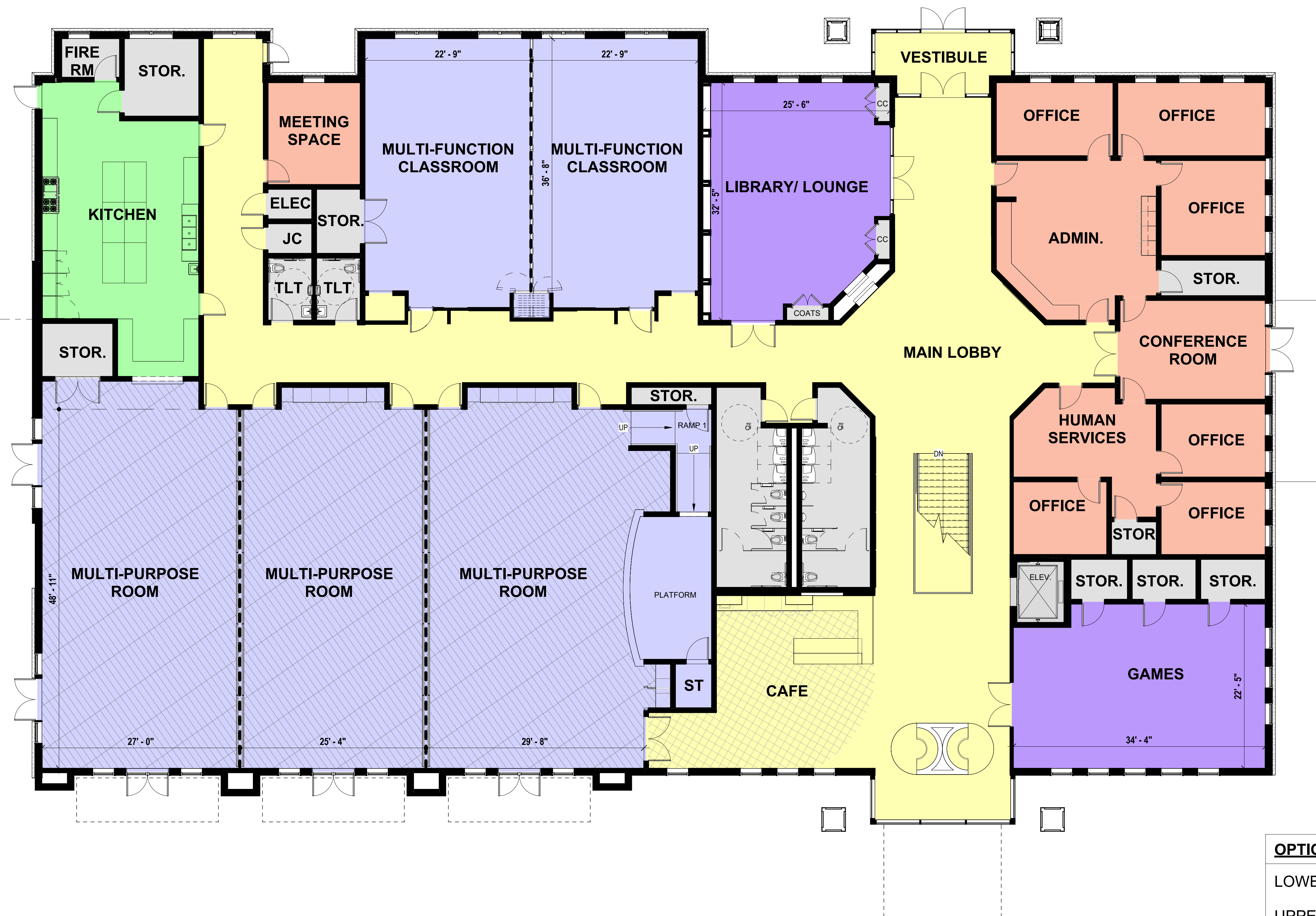
UPPER LEVEL FLOOR PLAN - OPTION 1

TRUMBULL COMMUNITY CENTER | 5958A MAIN STREET