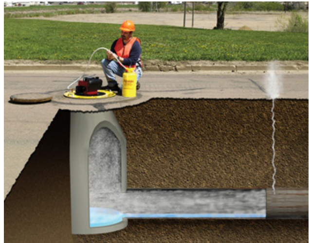
1: Smoke Testing (photo for informational purposes only)